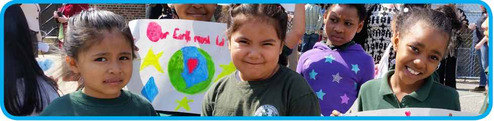
Nebinger Elementary School rain garden ribbon cutting ceremony