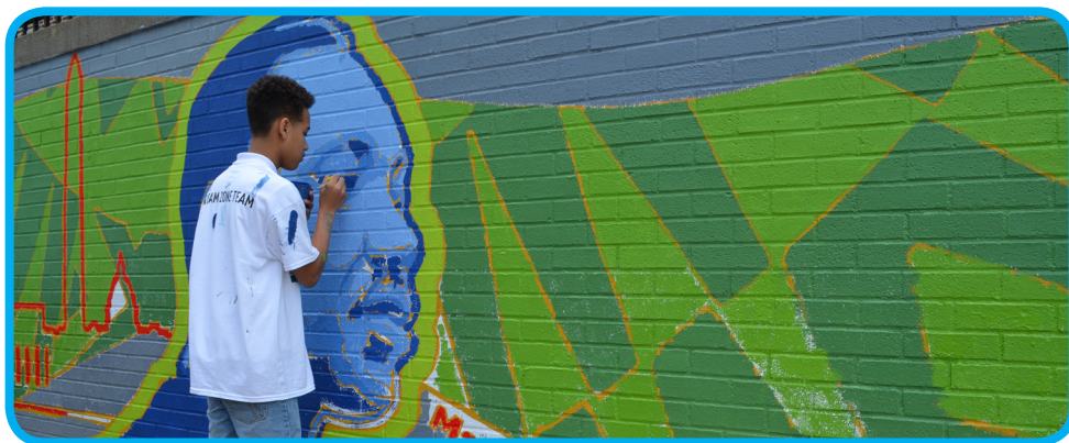
Disston student painting mural at the Philadelphia Eagle's Disston Dream Zone playground build