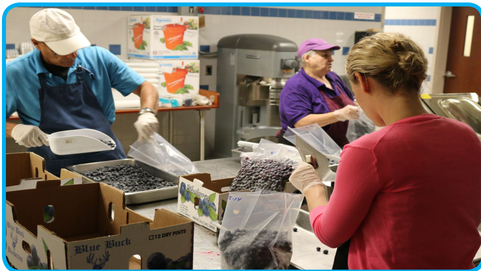
Food prep