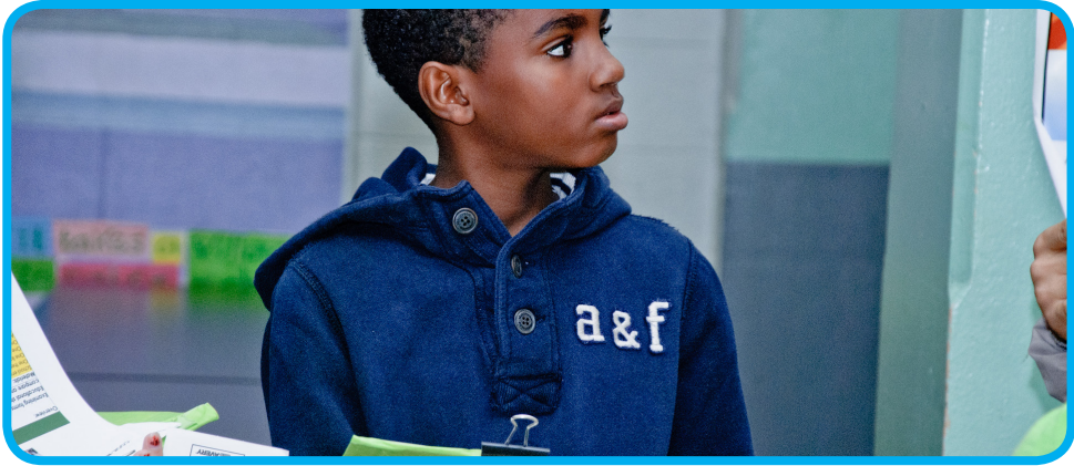
Cook Wissahickon Green Apple Day of Service